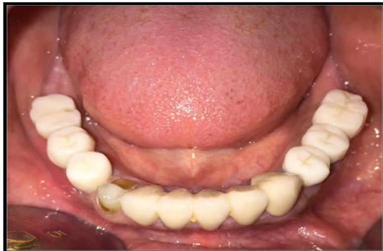
Final prostheses (6 separate crowns) were placed 3 months