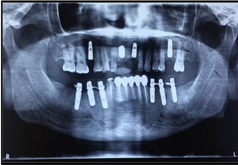
Orthopantomogram was repeated after 3 months.