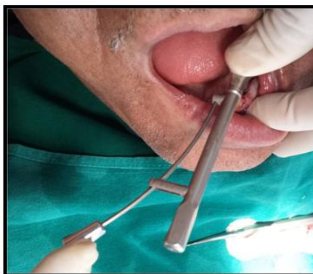
Implant stability was tested with a reverse torque of 30 Ncm.